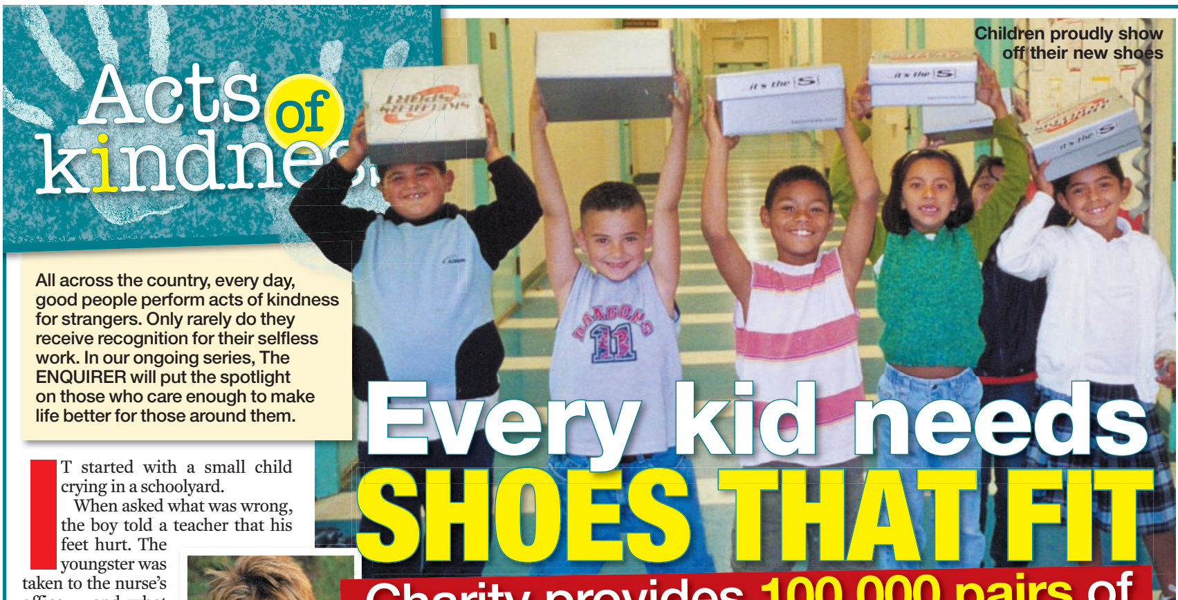
Children proudly show off their new shoes