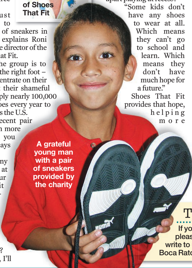
A grateful young man with a pair of sneakers provided by the charity