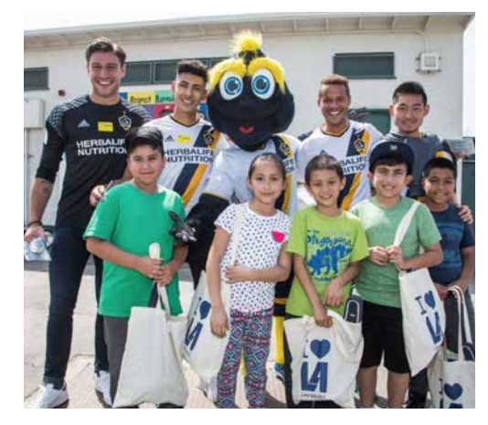
LOS ANGELES GALAXY

Who knows better than elite athletes the impact a new pair of shoes has on a kid who wants to run, jump and play? Shoes That Fit is the perfect philanthropic fit for these athletes, their organizations and their families. We are so proud to have these talented humanitarians on Team Shoes That Fit!